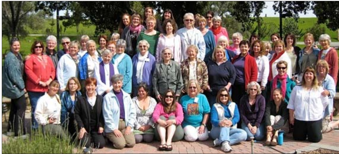
A group shot of all of the wonderful ladies at the Annual Stone Church Women's Retreat in San Juan Bautista (you will find more pictures on page 7)