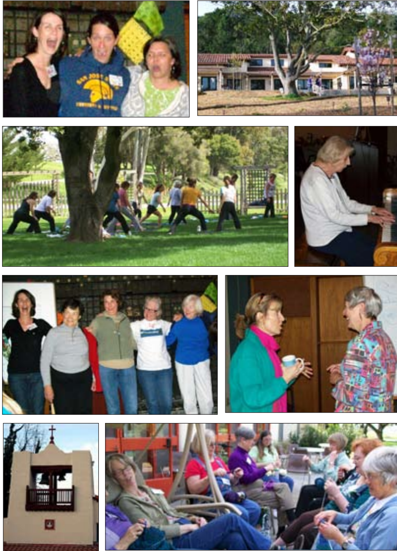
More Photos of the Wonderful Women's Retreat at St. Francis Retreat Center, San Juan Bautista, March 19-21