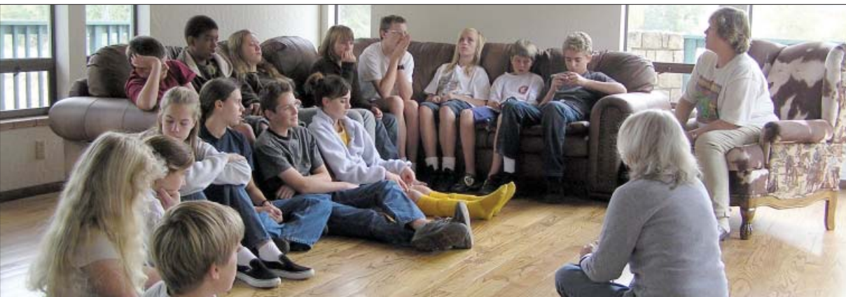
Another picture from the Middle School Luxury Camping Trip!