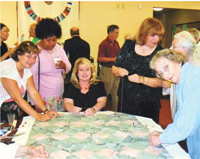
Working on a prayer quilt in the Social Hall