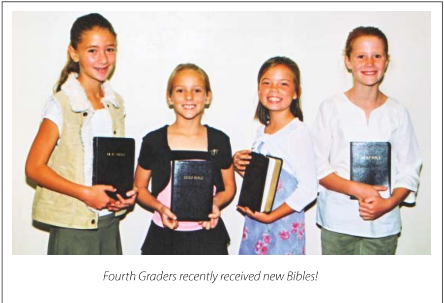
Fourth Graders recently received new Bibles!