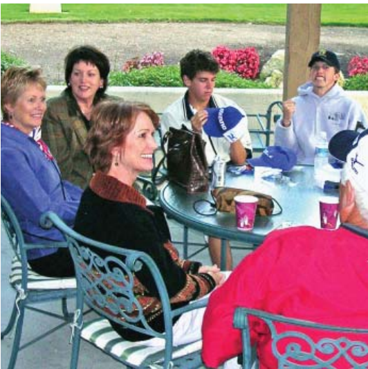
Golfers and friends share an "après-golf" moment at the annual Stone Church golf tournament.